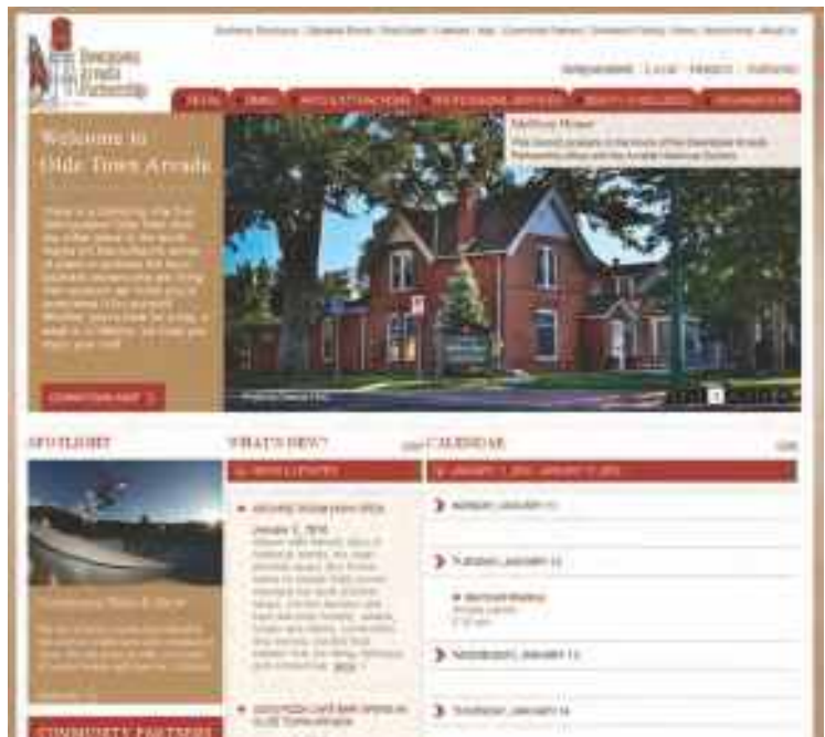
Downtown Arvada Website