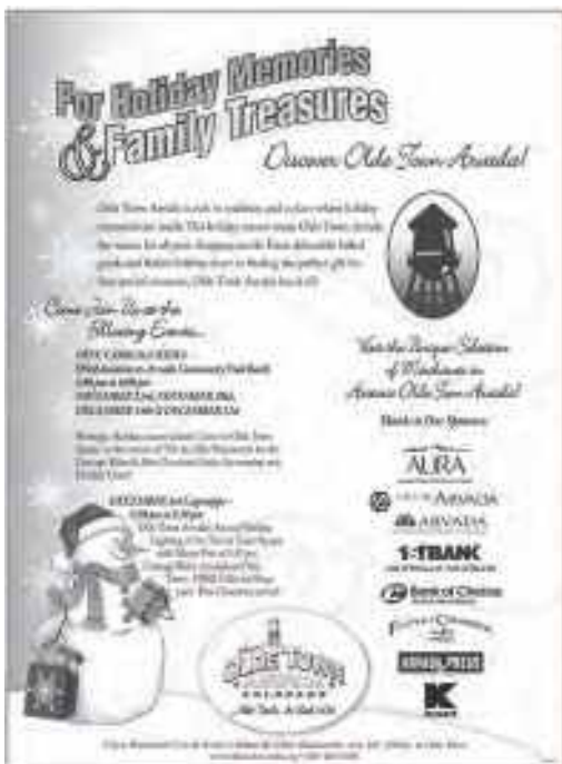
Arvada Press Advertisements